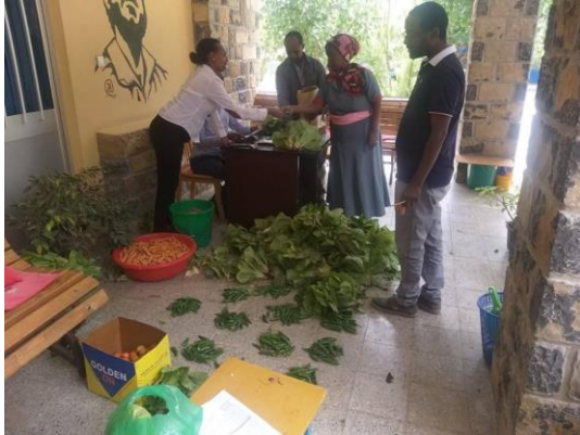
Distribution of vegetables at the school