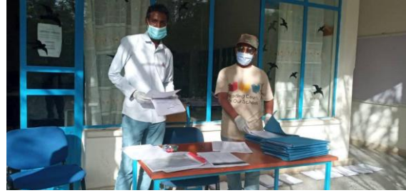
Student handout and worksheet distribution