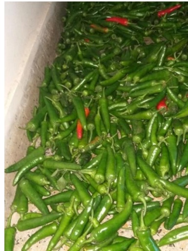
Chilli peppers are essential for traditional Ethiopian dishes

Our science staff has been especially busy producing bleach and hand-sanitisers. They have also been researching the use of Neem (a variety of tree which grows in Ethiopia) extract as an insect repellent. Using Neem trees growing on the school campus, they have made extracts from the leaves to make a crop spray which is environmentally friendly. This natural pesticide stops bugs from eating plants and vegetables, but most importantly it acts as a repellent against desert locusts. Huge swarms of these voracious locusts are again devastating crops in East Africa and have recently been seen again in regions close to Mekele. This is the main growing season in the country and so any locust attack would be catastrophic. Rainbows4children and the Nicolas Robinson School especially appreciates the great support of Mekele University in giving advice and training in many of these projects, especially regarding tree planting and natural insect repellents. The Tigrai Plant Tissue Laboratory in Mekele has donated more than a thousand bamboo seedlings as well as other plants. We have also had some support from the charity CultivaId, who are working on agriculture projects in Tigrai and have send some of the experts to give advice on vegetable planting and have provided seedlings.