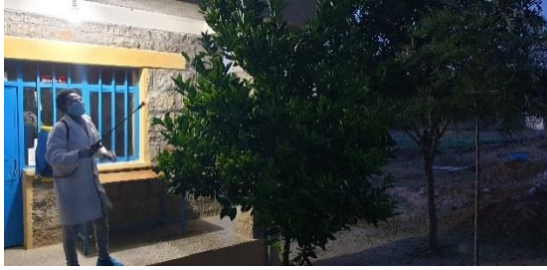
Our head of science spraying trees with neem insect repellent