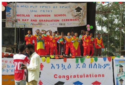
Graduation, singing performance