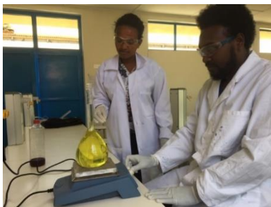
Hand sanitiser preparation