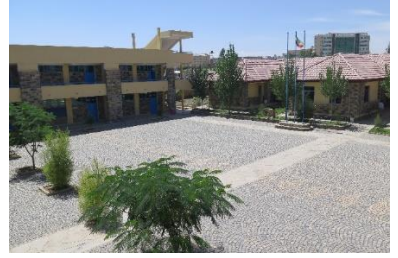
Landscaping in the secondary school