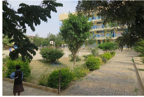
The primary school now has mature trees