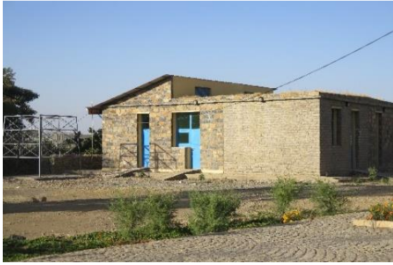
First aid rooms