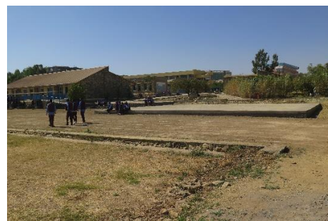
Completed sports work in December

2018: landscaping work and small site improvements were made in all schools. In addition the KG toilets were renovated as they are now more than 15 years old.