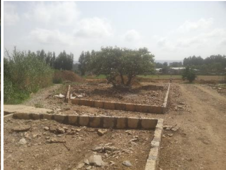
Landscaping the road leading to the running track, work in progress, July 2017