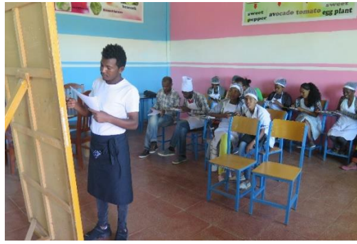
Students in the new food preparation training workshop