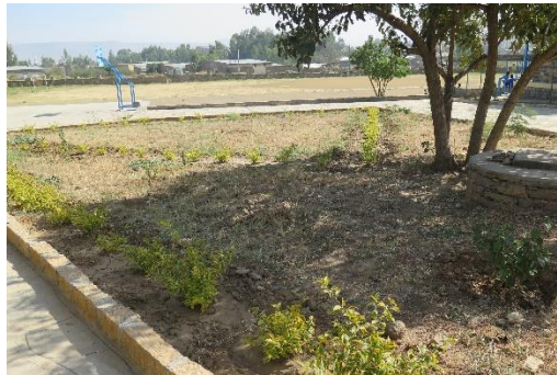
Landscaping in the secondary school

2019: ICT training for adults has started with a trial in March 2019 and a course for teachers was run in the summer vacation. Entrepreneurship training started in May 2019 and a second successful intensive course was run by PUM in November 2019. A traditional house has been built as a cosy break-out area to encourage spoken English. In the staff café area, a traditional coffee house is now used to entertain guests and celebrate special occasions and the café area has been extended.