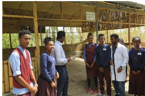
ICT training for adults (school teachers)