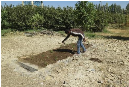
Preparing the reed bed filtration