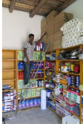
Filling the store