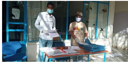
Testing pesticide in the fight against locusts Handing out class work when school closed through Covid.

December 2020 – our students from ALA and UWC have been accepted at colleges in the US, to start in the summer of 2021.