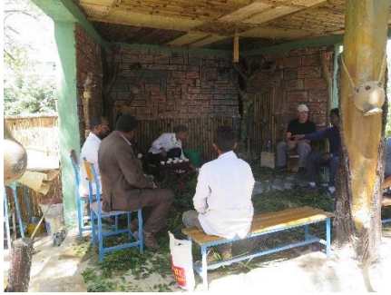
Traditional coffee area