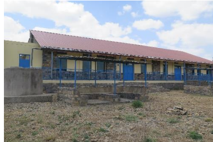
The training workshops

2017: the training workshops were equipped for the start of hospitality training in February 2017. The first course was food preparation and then serving at table was added for the second group. We were assisted by the Dutch training organisation PUM who helped train our trainers. During the summer work started on cleaning and clearing land for a running track (80m) and other sports facilities as well as tidying areas for more landscaping and tidying the campus.