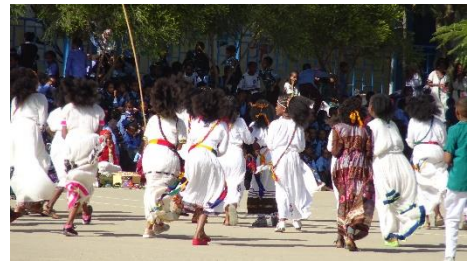
traditional dance festival