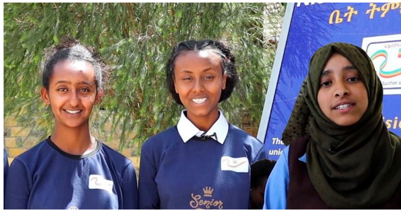
Our scholarship students

2020: The year started with ambitious plans for further developments at the school. Under consideration were a STEM centre (Science, Technology, Engineering, Maths). Also we started the investigation of the installation of solar panels for the provision of constant electricity of more critical classrooms and facilities in the school. During the late spring we worked with Mekele University volunteers as well as the Mekele Institute of Plant technology to plant seedling trees and bamboo to grow at the school, as part of a re-greening project. Other areas were set up for growing vegetables, eventually for sale to the staff and community. To help this project, REST (Relief Society of Tigray) donated and installed a borehole on the site for the school.