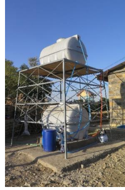
the water cleaning unit