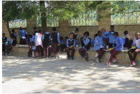
Landscaping in the primary school